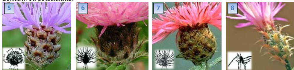
Figures 5-8. Other non-native knapweeds that may occur in Montana, but are not on the state noxious weed list (northwestern state(s) where noxious). (5) Brown knapweed, C. jacea , (WA); (6) Black knapweed, C. nigra (WA); (7) Meadow knapweed, C. pratensis , (ID, OR, WA); (8) Squarrose knapweed, C. virgata (UT).

Except for yellow starthistle with its bright yellow flowers and long, sharp spines (Figure 4), a careful examination of knapweed bracts is necessary to distinguish among them (see insets in Figures 1-8).