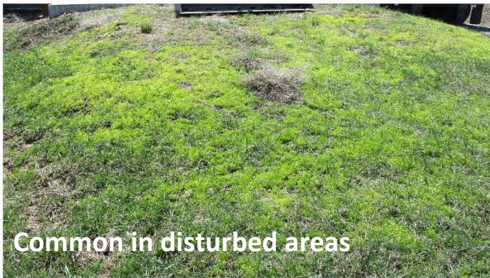
Common in disturbed areas