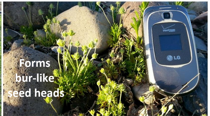
Forms bur-like seed heads