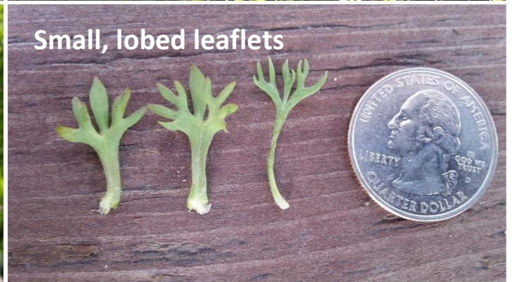
Small, lobed leaflets

Bur buttercup ( Ranunculus testiculatus ): Along with yellow and desert alyssum ( October 2017 Weed Post ), bur buttercup is one of the first weeds to flower in the spring. It is a non-native annual that often forms a carpet of yellow along roadways, parking lots, and other disturbed areas. Flowers, which have 2-5 yellow petals, last about 3-4 weeks and then form bur-like seed heads. These burs can cling to animal fur or human clothing, and they become very prickly as they dry. Other common names for bur buttercup are hornseed buttercup or curvseed buttercup, both describing the plant's bur-like anatomy. This species is a "dwarf" plant, growing only 1-3 inches tall. It has basal leaves that are <1 -4 inches wide, and leaves are divided into 3 ovate, lobed leaflets. Leaf shape can vary. Leaves and stems are pale green and have short, woolly hairs. Although this species is often overlooked, it can be an agricultural pest and toxic to livestock. It typically grows in areas where little to no other vegetation is growing. Bur buttercup can be managed with an appropriate herbicide in bare ground environments, but remember that it flowers very early in the spring. In other areas, limiting disturbance and nurturing the growth of other vegetation is recommended.