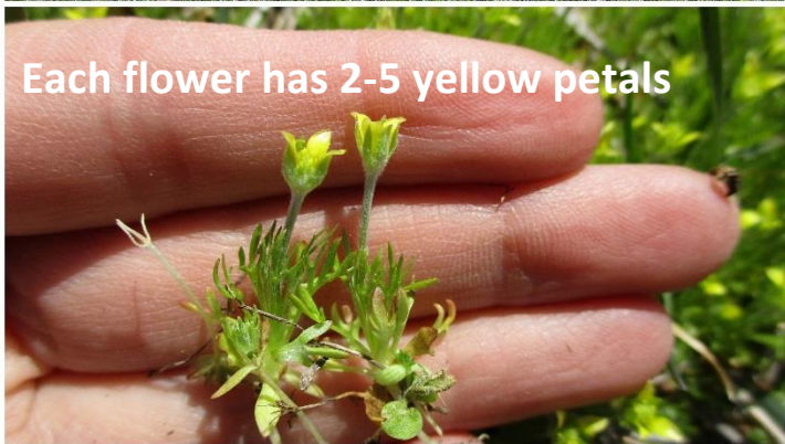
Each flower has 2-5 yellow petals