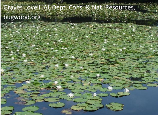
Graves Lovell, AL Dept. Cons. & Nat. Resources, bugwood.org

Introduction: Fragrant waterlily is a floating, aquatic perennial plant that grows in lakes, ponds, and slow-moving streams. Its nativity is questionable: some sources indicate it is native to all of North America while others indicate it is native to eastern North America and considered introduced or naturalized in western regions of the continent where it sometimes exhibits invasive behavior. The first record of fragrant waterlily in the northwestern United States was in 1933 in Pierce County, WA, and it was reported in Missoula County, MT, soon after in 1937. Fragrant waterlily is listed as a noxious weed in Washington.