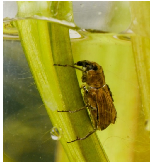
Bagous nodulosus weevil feeding underwater on flowering rush stem

Currently, there are four potential agents that are being researched in Europe. One of the four, Bagous nodulosus , is a weevil. Adult weevils have been collected from the leaves above and below the water surface. The larvae feed on the leaf bases and rhizomes of flowering rush. Initial host specificity tests on ten different species indicated that the weevil will not lay eggs on any other species than flowering rush. In 2015, additional tests will be conducted on this agent to further evaluate it for host specificity and impact on flowering rush. The European scientists that are conducting the research are also hoping to improve rearing methods for Bagous nodulosus and to collect and begin detailed investigations for the three other potential agents.