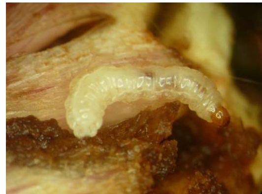
Bagous nodulosus larva damage at leaf base of flowering rush