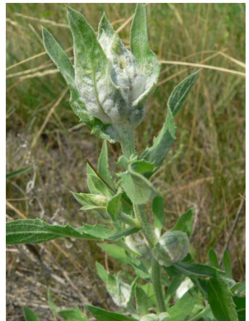
Galls formed by Jaapiella tip gall midge

Two insects that target Russian knapweed have recently been added to the list of approved agents for field release. Jaapiella ivannikovi , a tip gall midge, appears to have an impact on the weed especially where the agent is combined with properly-timed mowing, herbicide use, or grazing. Aulacidea acroptilonica is a stem galling wasp that stunts plant growth. However, these wasps are fed upon by native parasitoids, grazing livestock and rodents which can hinder population growth. Both the wasp and midge are well established in Montana and may build-up high populations. Studies have been initiated to determine the effect of these agents on the clonal nature of the plant. In addition to these newly approved agents, there are two additional agents, a flower mite and a defoliating leaf beetle that are still being researched by European collaborators.