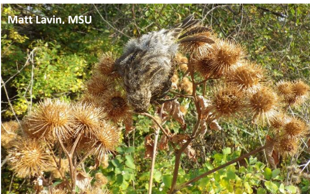
Matt Lavin, MSU

Impacts: The value of sheep's wool can be reduced when burdock seed heads are entangled in it. Additionally, birds and bats can become trapped on the clusters of burs on the plant (photo, left). Common burdock is a secondary host for pathogens, such as powdery mildew and root rot, which can spread to economically important plants. Some people use common burdock as a medicinal herb due to its anti-inflammatory, antioxidant, and anti-bacterial properties. In Japan, burdock root is cultivated as "gobo" and is used in cooking.